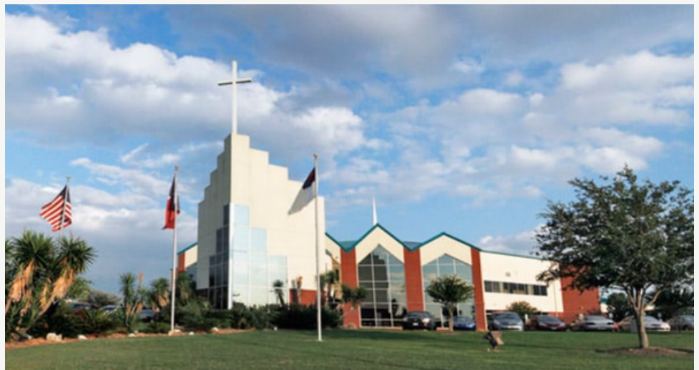
Parkway Christian Academy